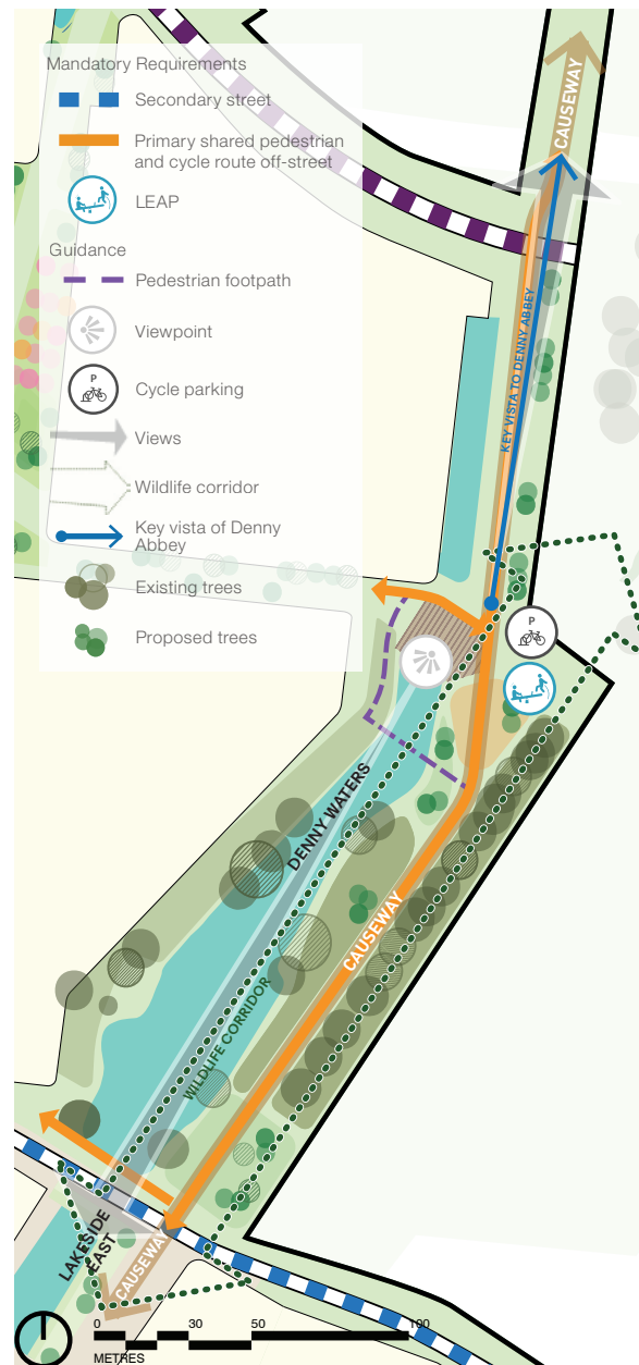
Figure 4.78: Indicative landscape proposals - Denny Waters