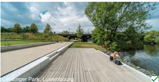
Cessinger Park, Luxembourg Figure 4.77: Good example of a clearly defined route with a subtle intervention to enable interaction with the waters edge