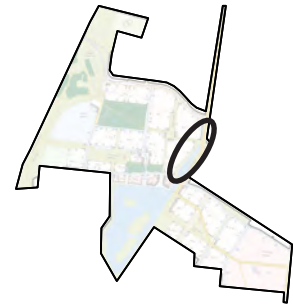
Figure 4.76 Location in KP1 in accordance with the Regulatory Plan